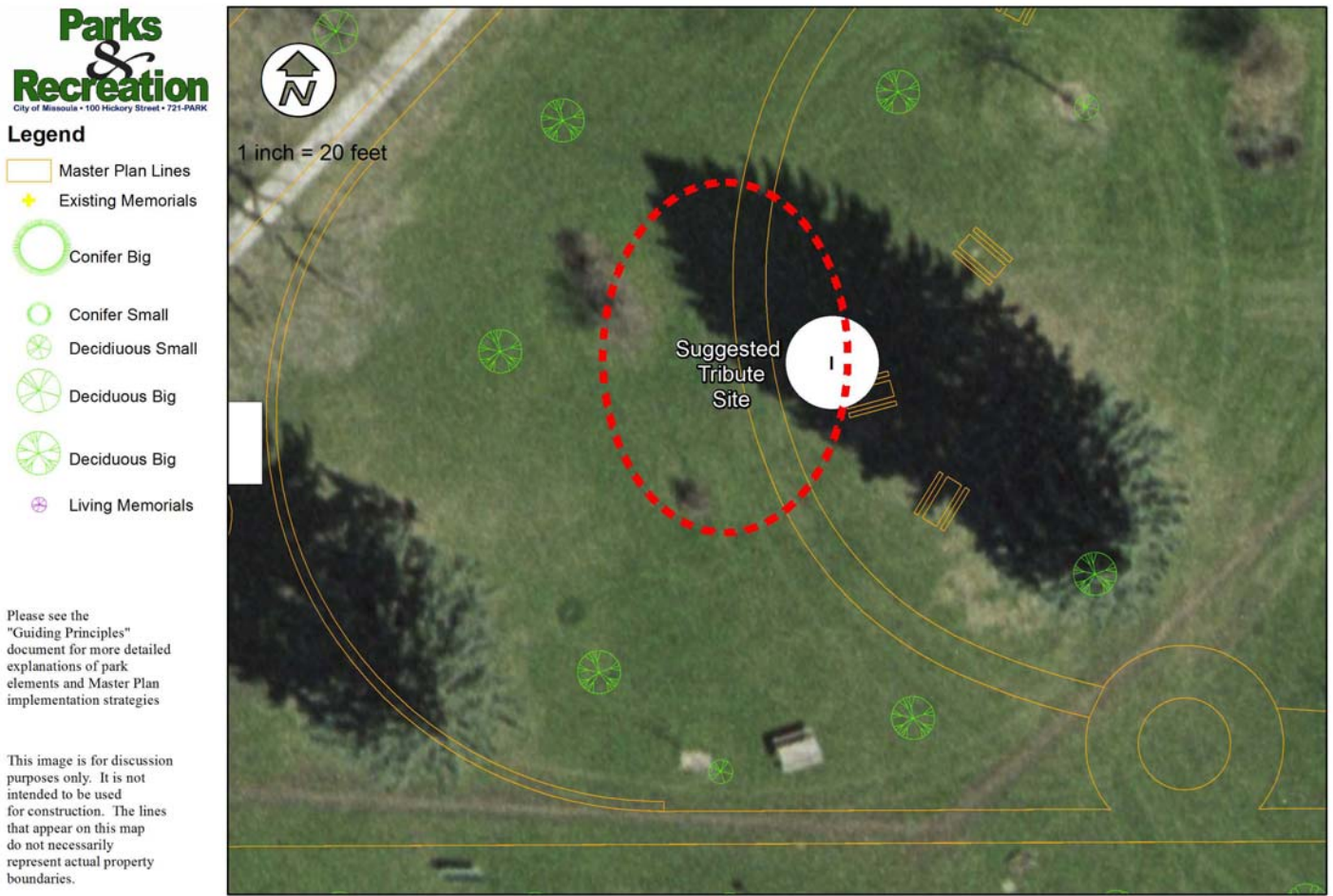
Above: Detail of proposed Tribute site. Red circle depicts approximate location.