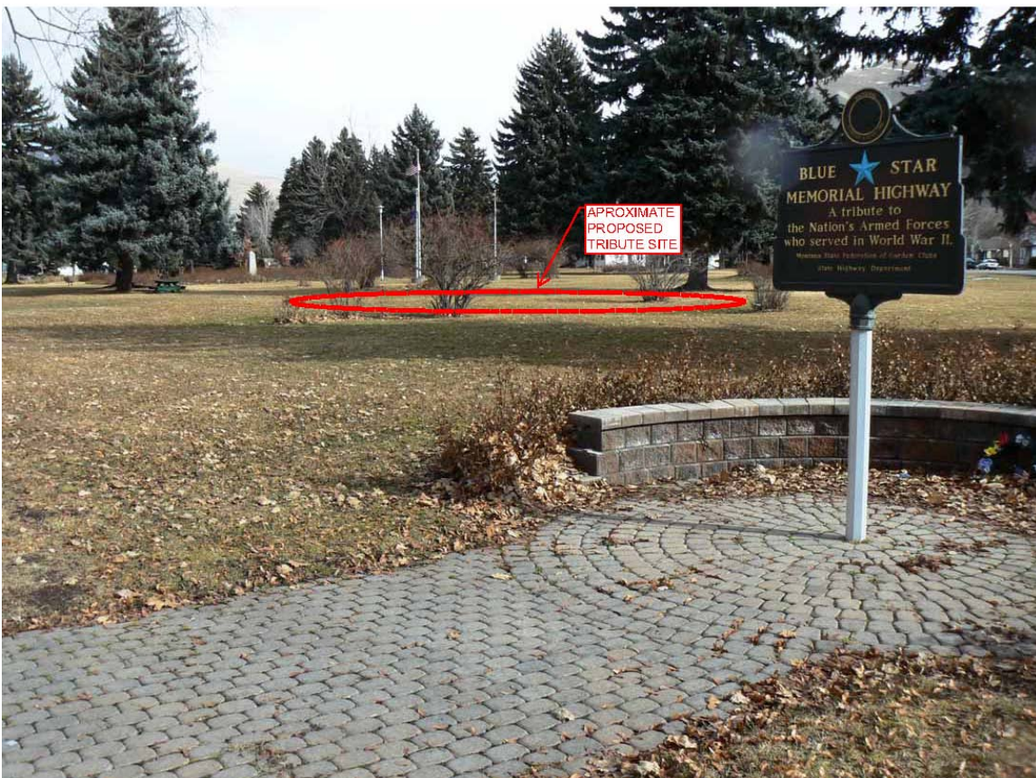
Left: Red circle depicts approximate location of Tribute site, in Memorial Rose Garden Park - looking southeast.