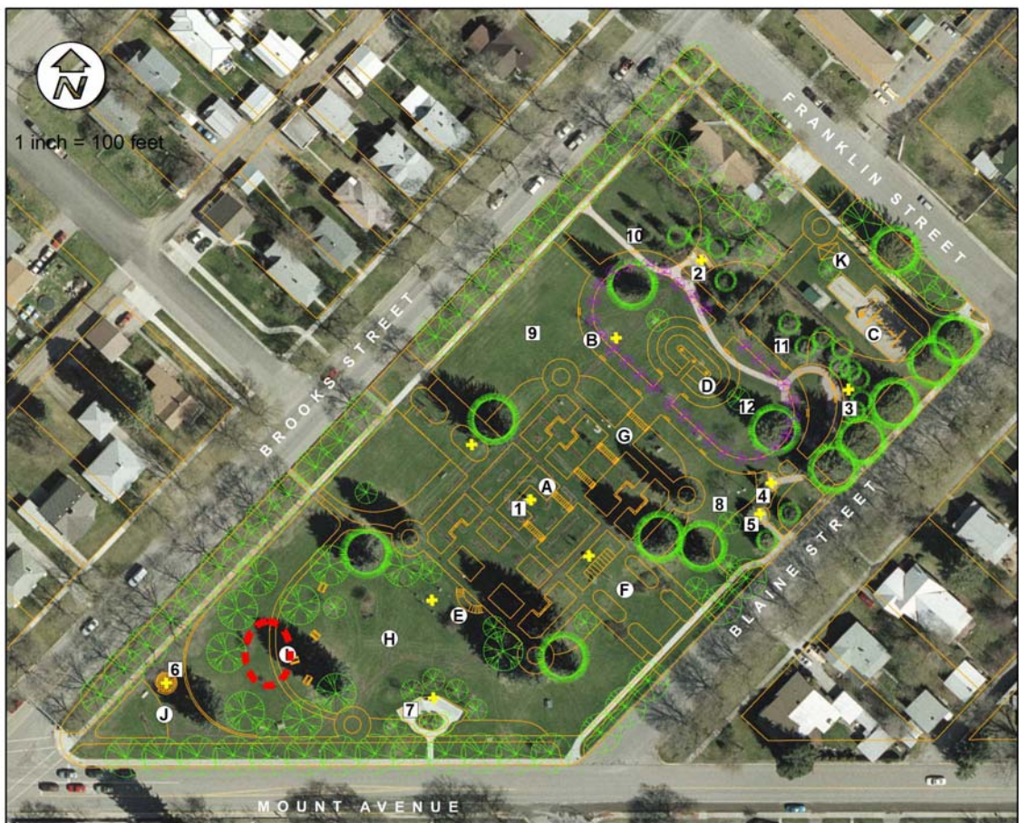
Above: Aerial of Memorial Rose Garden Park. Red circle depicts approximate location of Tribute site.

This image is for discussion purposes only. It is not intended to be used for construction. The lines that appear on this map do not necessarily represent actual property boundaries.